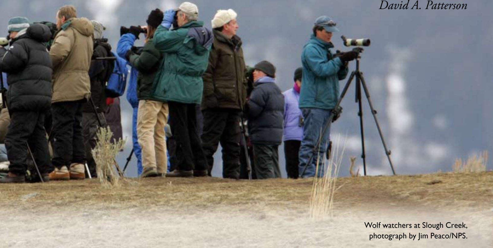
Wolf watchers at Slough Creek